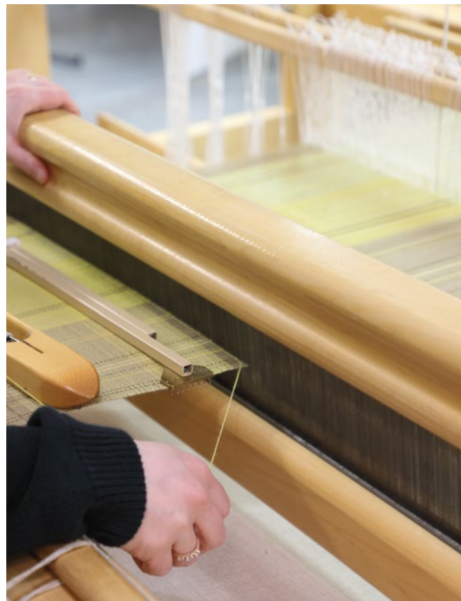
Draw thread slowly into place with the beater. The weave has same number of weft picks to warp threads per cm.