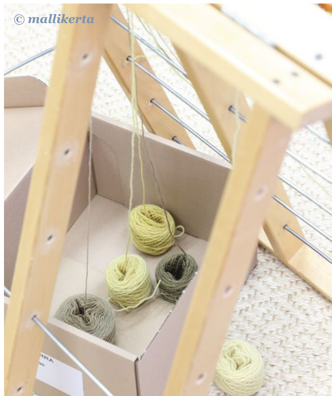
Wind the yarns as balls and start to pull out from the center. The yarn ball stays steady in place and warping is fast and easy.