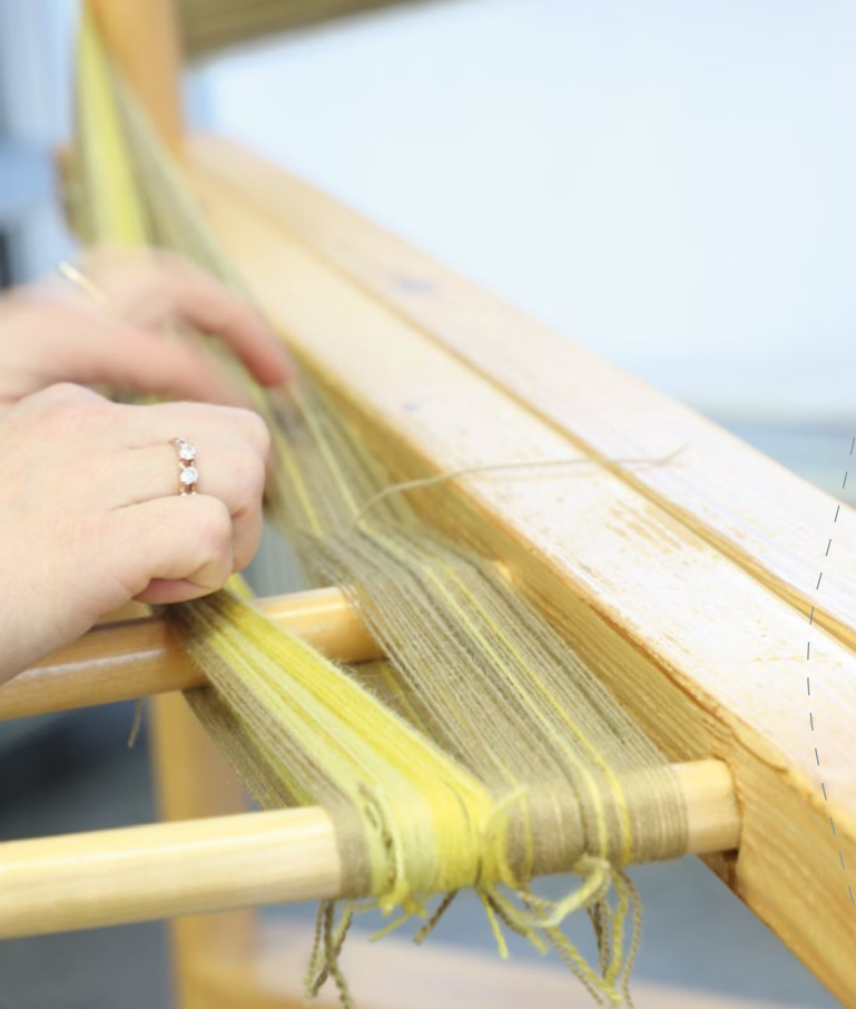
Design the stripes from the colours you have in use. Take a darker shade or a different colour from the others for one thread stripes.