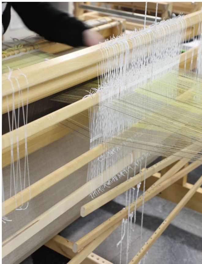
You need only two shafts and treadles for this scarf! Weave lightly.

Make a twisted fringe with 3 + 3 warp threads. The length of the finished fringe is 8 cm. Iron through the damp ironing cloth.